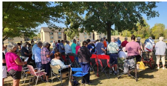
A Park Full of Presbyterians! (Rotary Park, Newark)